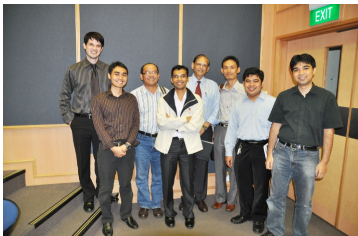
Speakers of a one-day workshop on Industrial Drying Technologies - Principles and Practice