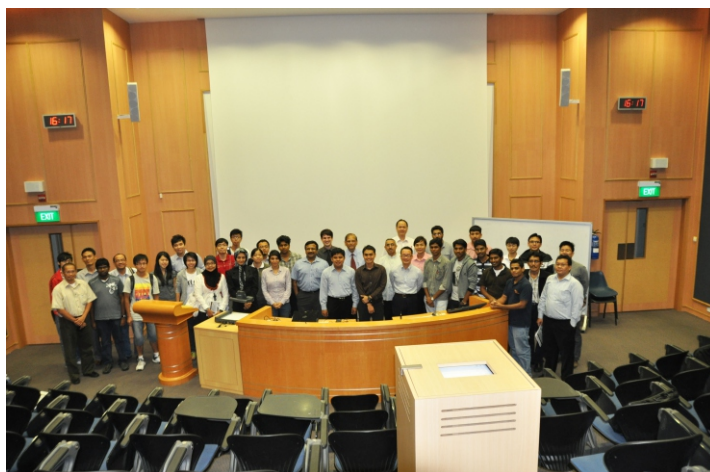
Attendees of a one-day workshop on Industrial Drying Technologies - Principles and Practice with speakers